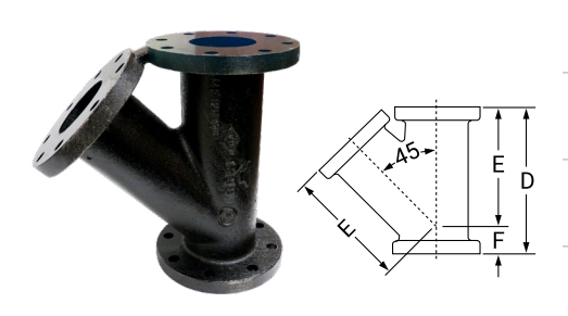
Fig. 823 Flanged Lateral (Class 125 Standard)